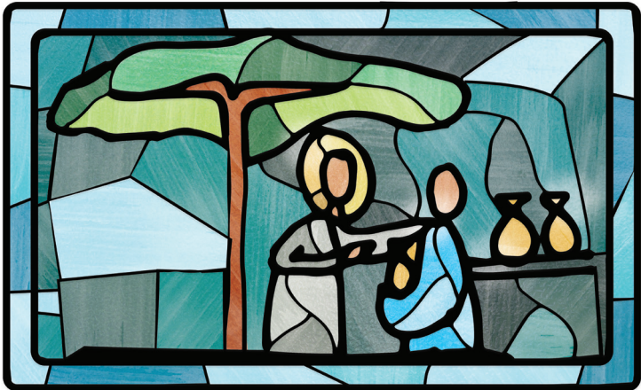
The Calling of Matthew